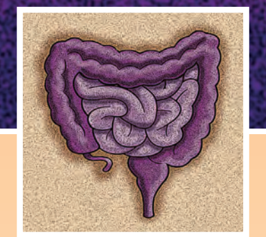
By Nancy DeVault

upon arrival at the hospital, a scan revealed that Beth had Crohn's disease, a chronic condition involving the gastrointestinal